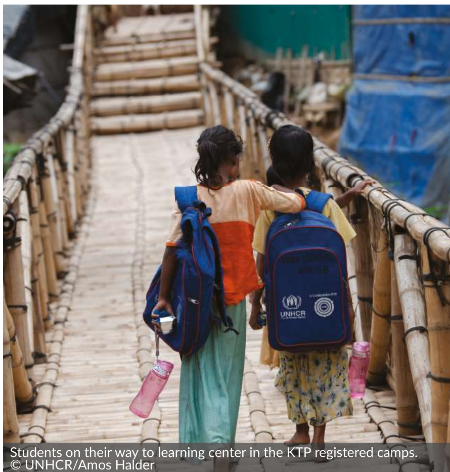
Students on their way to learning center in the KTP registered camps.

330 Adolescents and youth participated in basic numeracy, literacy and life skills courses