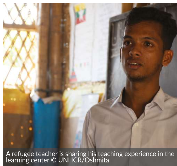
A refugee teacher is sharing his teaching experience in the learning center