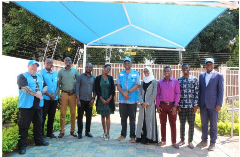
Refugee students meet UNHCR Representative before leaving for Italy to commence studies through UNICORE programme.