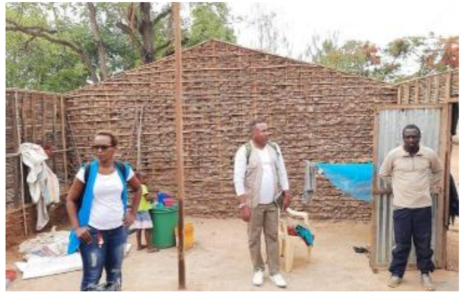
During shelter assessment in Maratane refugee settlement following 30 th November storm.