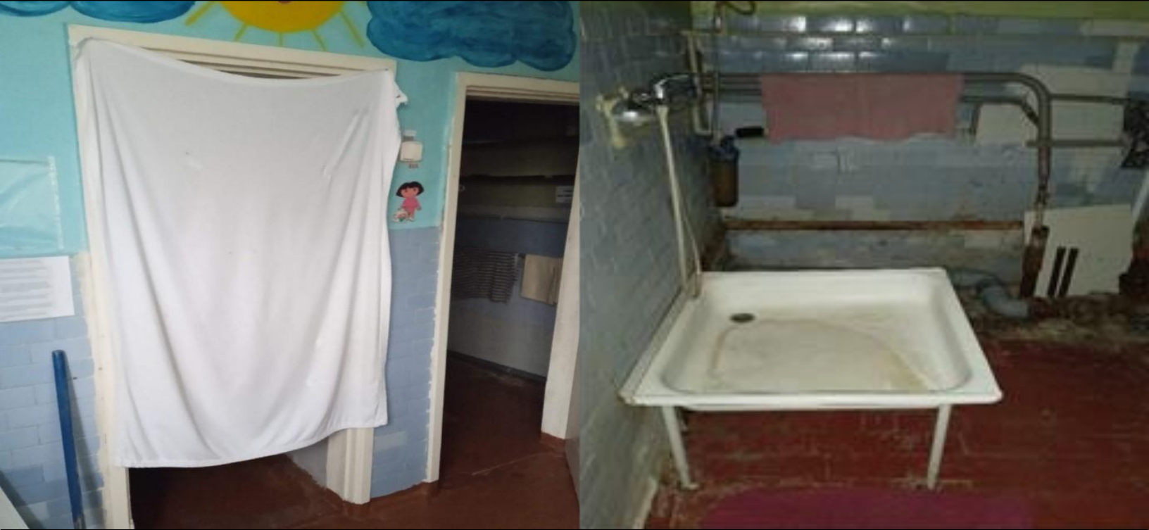
WASH facilities (bathroom and toilet) in the collective center (Dnipropetrovska Oblast)