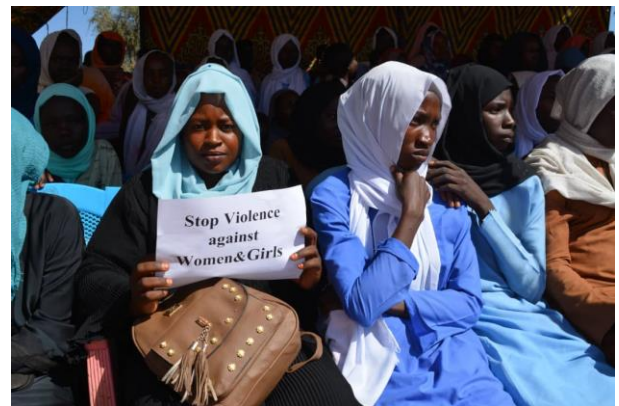
IDPs participating 16 Days of Activism event in Central Darfur.

Refugees, host community, and government representatives participated in several events to mark 16 Days of Activism Against Gender-Based Violence in North, East, South, and Central Darfur States. The activities included street march, drama, traditional dance and drawing competitions which highlighted common forms of GBV, including child marriage and domestic violence, and requested collaborative efforts to prevent these in line with the theme "Unite! Activism To End Violence Against Women & Girls".