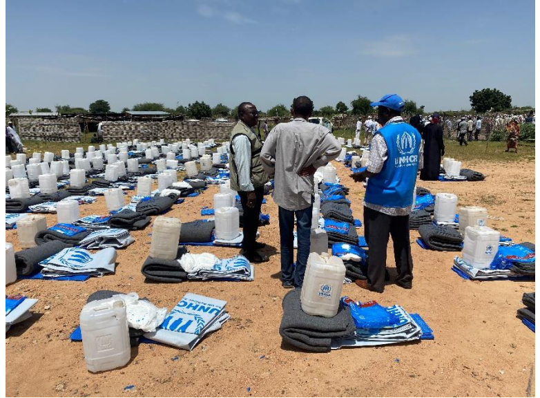
The NFI distribution process for the flood affected communities in Darfur states.

Post-distribution monitoring (PDM) for the flood response is ongoing. At the same time, 6,904 refugees, IDPs and host community households affected by floods received NFIs distributed by UNHCR & partners in November.