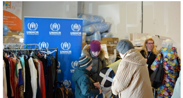
Refugees collecting core-relief items from the social market at RomExpo, Bucharest on 1 February 2023.

In 2023, UNHCR's winterization programme has reached some 15,300 refugees from Ukraine throughout the country with core-relief items (CRIs). Items distributed include 5,000 blankets and quilts, 10,000 winter clothes, 500 sleeping bags, 3,000 cooking pots and 2,150 family hygiene kits. During this week, 12,000 items were distributed to refugees in Bucharest, Brasov, Suceava, Galati and Constanta.