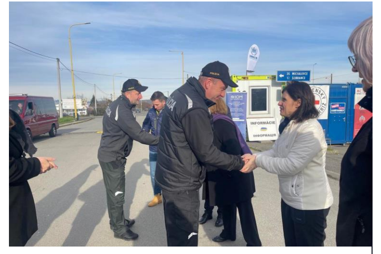
The Head of Košice Field Office greeting the border police at the Vyšne Nemecké BCP.

In 2022, Slovakia saw a rapid influx of refugees fleeing hostilities at its four border crossing points with Ukraine. The majority were women and children and included older people, people with disabilities, and those with urgent medical care needs. While the initial influx has stabilized, the volatile security situation in Ukraine leaves open the possibility of another wave of people crossing the border to Slovakia in the future. Many of those arriving have experienced trauma and distress associated with the conflict and require Mental Health and Psychosocial Support (MHPSS). Border authorities continue to process new arrivals, providing information on temporary protection and asylum, with onward transport available for those seeking to reach urban centres. Information is provided by UNHCR and partner staff at all border crossing points alerting refugees to available