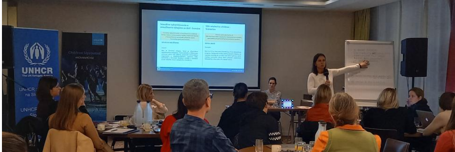
UNHCR with WHO, UNICEF and IOM held a three-day Training of Trainers in

Within the RCF, seven working groups and sub-working groups are operating (Anti-Trafficking, Cash, Child Protection, Health, Information Management, MHPSS, Protection and Inclusion) as well as a Prevention of Sexual Exploitation and Abuse (PSEA) Task Force, while Accountability to Affected Persons (AAP) is mainstreamed across all groups and has been made a RCF standing agenda item. RCF partners are furthermore supporting the ongoing engagement of the Slovak Republic with the Global Compact on Refugees (GCR) as a means of systematizing and sharing good practices with other countries facing similar challenges, and in view of cultivating pledges related to its national response for the Global Refugee Forum in 2023.