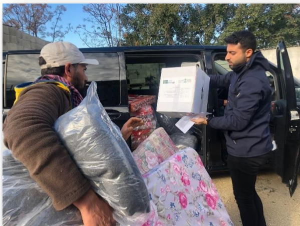
Provision of winter assistance in Sarafand, South governorate.