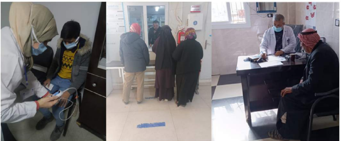
(Afrin– 14 th 2023, Idlib: Sarmada's Mobile Team visit temporary shelter camp)

Our Afrin PHCCs are open and provide emergency support. Our staff is coordinating with the Civil Defense and Hatay Provincial Health Directorate. We have seconded one of our Orthopedics Doctors to Afrin Hospital to help respond to the demand. Local authorities have also asked for our support in health services. We deployed a mobile medical team (MMT) around the region. We also have an MMT in Afrin that provides first aid response, health screenings, medication distribution and psychological first aid. In addition, DDD needs more medications, emergency aid, tents, and containers for homeless staff to allow them to continue working.