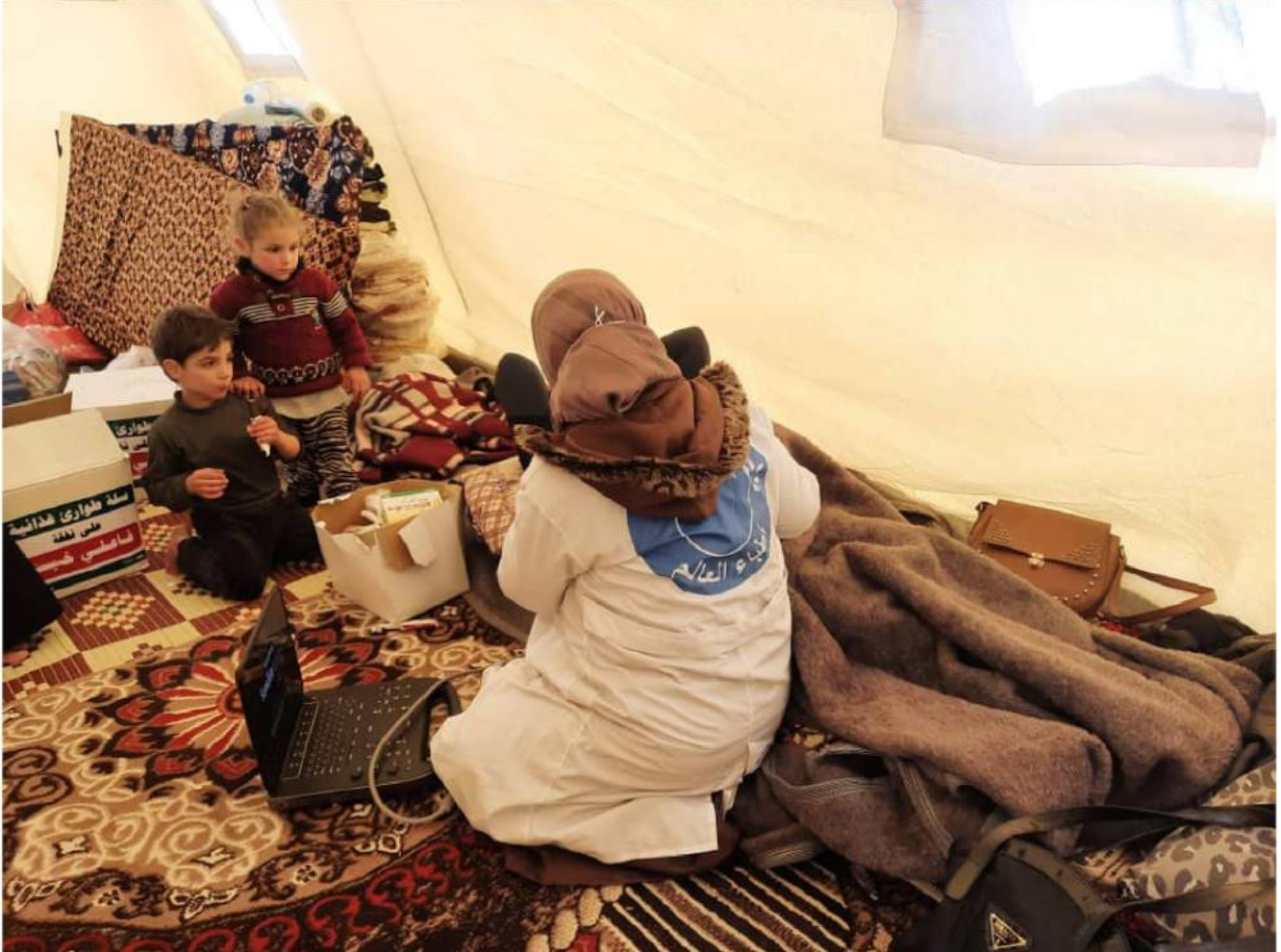
Sarmada's Mobile Team visit temporary shelter camp, February 13-14, 2023, Idlib