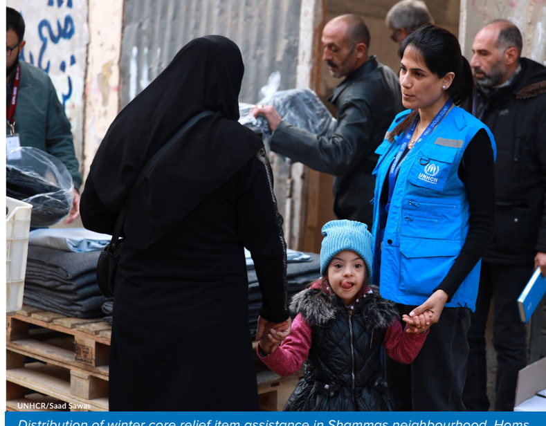
Distribution of winter core relief item assistance in Shammas neighbourhood, Homs city, Syria.

cash assistance. As of end-December, 17,057 individuals received the first tranche of the winter cash grant. The amount of the grant varied depending on family size, with an average of SYP 543,000 ($181) per family. The total amount of cash assistance disbursed so far is around $1.2 million.