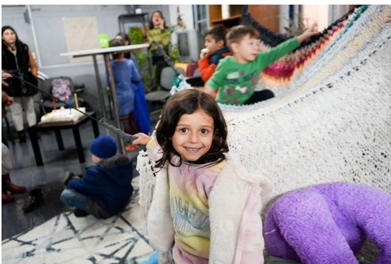
Ukrainian refugee children play at the children's area at Mandak House community center, Devai Inn.

1 Multi-country office in Budapest, also supporting national offices in the Czech Republic, Slovakia and Slovenia.