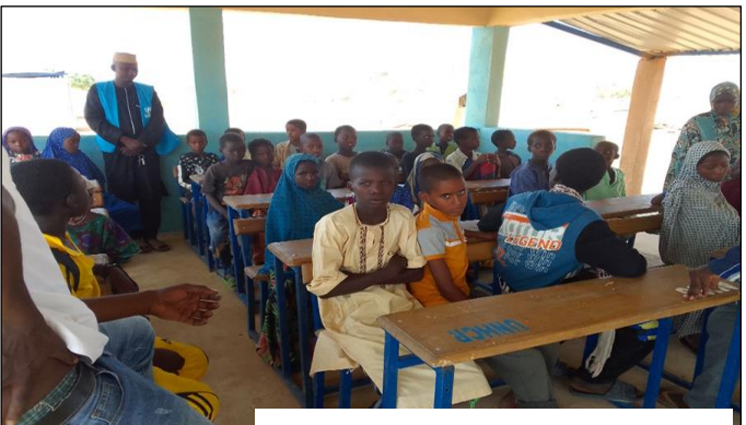
An accelerated education centre (SSA/P) set up by UNHCR in the Gao region, Mali.