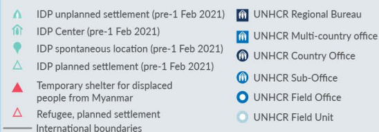
Estimated internal displacement within Myanmar Pre+Post 1 February 2021 (rounded to the nearest hundred)

The boundaries and names shown and the designations used on this map do not imply official endorsement or acceptance by the United Nations