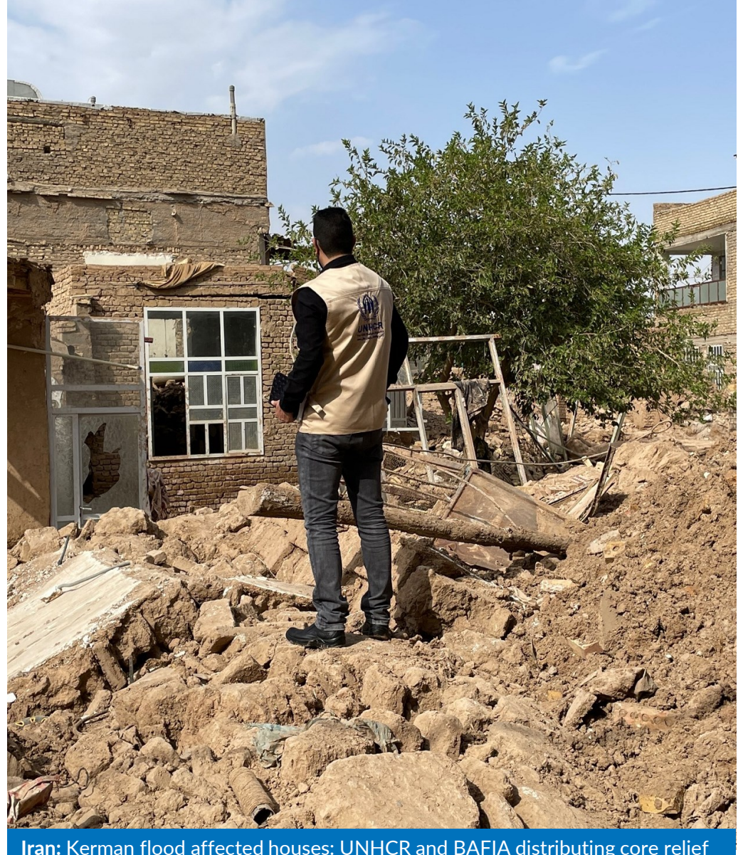
Iran: Kerman flood affected houses: UNHCR and BAFIA distributing core relief items to flood affected refugee and Iranian families in Yazd

Borders with neighbouring countries are likely to remain tightly regulated in 2023 but a certain level of population movement is expected to continue irregularly, increasing vulnerabilities and protection risks, including exploitation and abuse of those seeking documentation and crossing borders. Upon arrival, people moving through irregular channels are at increased risk of deportation, which may be in contravention of the principle of non-refoulement. RRP Partners continue to underscore the ongoing need for all countries to grant fleeing Afghans access to their territories and asylum procedures, and to respect the principle of nonrefoulement. It is imperative that this fundamental human right not be compromised and that people in need of international protection be afforded asylum. It is equally important not to forcibly return Afghans, which UNHCR has cautioned against in Guidance Note on the International Protection Needs of People Fleeing Afghanistan, updated in February 2023. Non-refoulement includes rejection of individuals seeking international protection at the frontier. Inter-Agency partners will continue to monitor the situation in Afghanistan with a view to assessing the international protection needs arising out of the current situation.