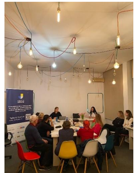
Workshop organised by Jobs4Ukraine for Ukrainian refugees on ways of setting up a business in Romania. 27 February

UNHCR and partners are supporting refugees in accessing livelihood opportunities. On 27 February, Jobs4Ukraine conducted a workshop on way to set up a business in Romania. Over 20 participants had the chance to learn more about procedures for opening a legal entity in Romania and ask Romanian advisors for further information. Moreover, participants had the possibility to interact with several Ukrainian women who opened already business in the county. In addition, UNHCR and partners are supporting refugees in researching job opportunities through dedicated web-platform, coaching them during their research for employment, and supporting them with Romanian language courses.