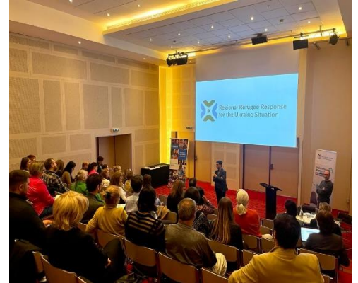
Refugee Coordination Forum, Bucharest, 10 March

On 10 March, the Inter-Agency team, led by UNHCR, organised an extended Refugee Coordination Forum (RCF) in Bucharest to present the strategic priorities of the Refugee Response Plan (RRP) Working Groups for 2023. The event counted with the participation of more than 50 representatives of RRP partners, authorities, civil society organisations and the international community. The RRP in Romania counts with 34 partners that are appealing for US$ 153 million for their programs in support of the national response in the country.