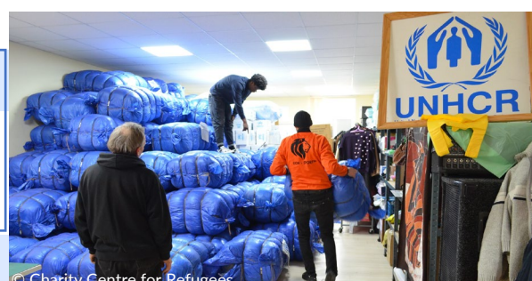
UNHCR delivering core relief items, such as blankets and hygiene items, to Charity Centre for Refugees for further distribution to the most vulnerable refugees and host communities. So far, UNHCR