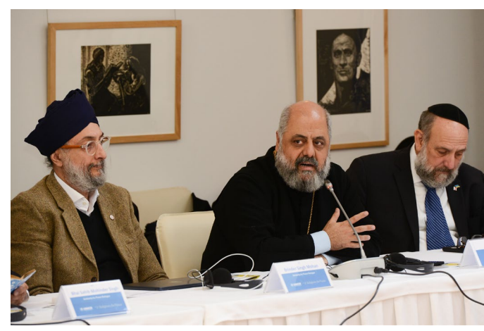
Earlier in February, the Government, Religions for Peace, and UNHCR, hosted a delegation of leaders of the world's diverse faith traditions, the Multi-Religious Council of Leaders. This initiative, bringing together international and local faith leaders as well as the Government and civil society to mobilize inter-religious support for refugees was the first of its kind. Faith leaders present encouraged their communities and faith-based organizations in their tireless provision of services and the promotion of inclusion and social cohesion in forced displacement contexts.

UNHCR is grateful for the support provided by donors who have contributed to this operation as well as those who have contributed to global UNHCR programmes with broadly earmarked and unearmarked funds.