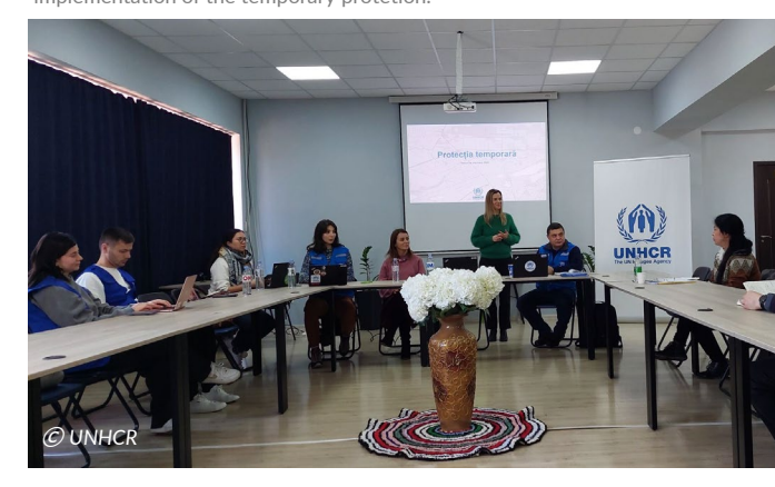
UNHCR protection, registration and communication with communities team conducting training the humanitarian workers on temporary protection.