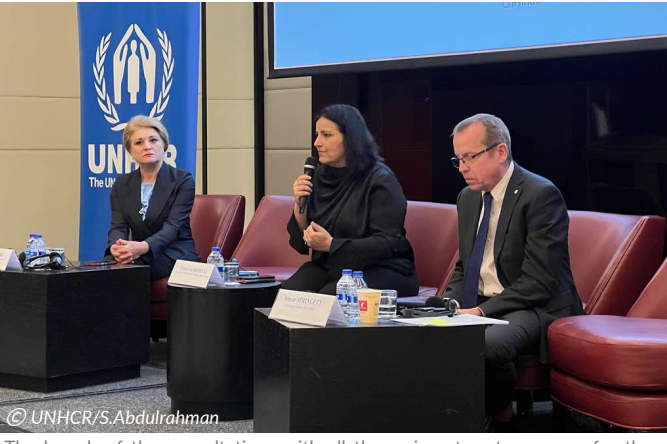
The launch of the consultations with all the main actors to prepare for the implementation of the temporary protetion.

UNHCR and Internews held a meeting with the Accountability to Affected Populations Taskforce members to validate the results of the Information Ecosystem Assessment for Moldova. The final report, to be released in March, surveyed over 2,000 refugees and hosting community members in Chisinau, Balti, Cahul and Comrat. The report aims to improve the information ecosystem in Moldova through data-driven recommendations.