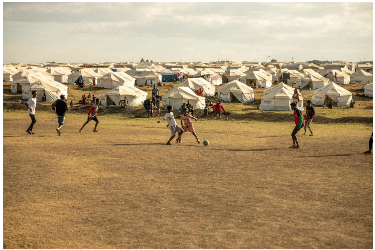
Young Eritrean refugees playing in Alemwach refugee site in Dabat, Amhara region, Ethiopia.