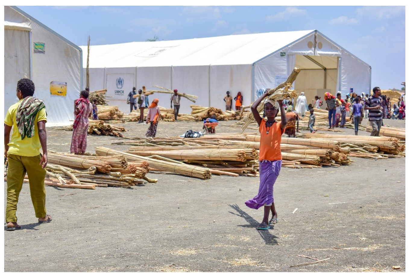
The distribution of emergency shelter kits in Babikri settlement in Gedaref State, Eastern Sudan, as part of rainy season preparedness. The kits will help strengthen shelters against heavy winds and rains in this region.

Germany and Switzerland delegation visits Kassala and Hamdayet : A delegation comprising of representatives from Germany and Switzerland undertook a mission to Kassala from 12-16 February with a focus on protection and counter-trafficking. Aside from visiting several of their funded projects in the Shagarab, Girba, and Kilo 26 camps, the delegation met with Commission for Refugees (COR) staff, community-based protection networks, and a youth group supporting counter-trafficking activities. On 14 February, the delegation visited Hamdayet where they met with COR staff, local security authorities, and community leaders. In addition, the delegation visited the reception center and spoke with a few of the refugee new arrivals from Eritrea. They were also taken near the border with Ethiopia to see the Tekeze river and areas where Ethiopian refugees had crossed into Hamdayet at the onset of the influx in November 2020.