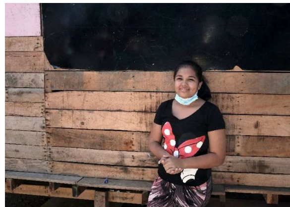
Together with her mum and sister, this young girl from Nicaragua sought refuge in Panama where they are now trying to rebuild their life selling food and bread.