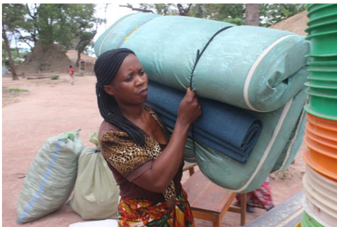
A Congolese refugee family in Mantapala settlement taking a mattress to loaded on the luggage truck before her return to the DRC under the voluntary repatriation programme.