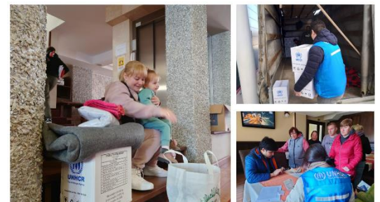
CRI distribution in Contanta on 30 March 2023.

On 30 March, UNHCR distributed clothes, bed linen, blankets, towels, and hygiene kits to 124 families (approx. 370 refugees) hosted in five hotels in Constanța. This week, UNHCR also distributed 3,000 bottles of water to 600 Ukrainian refugees and vulnerable Romanians residing in collective centres and private accommodations in and around Galati. In addition, following prior needs assessments, plates and cutlery were delivered to the Betesda Foundation in Galati to assist more than 40 refugees and people from the host community.