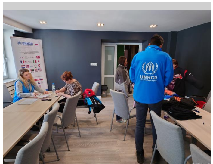
Distribution of winter clothes.

UNHCR has boosted its presence and response to provide targeted protection services, cash assistance and other types of support in line with the Government-led efforts.