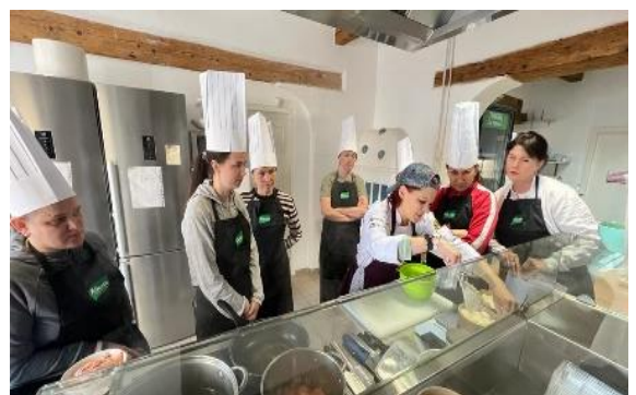
Participants of the cooking training for refugees on 25 April.

UNHCR and partners continue supporting refugees to access livelihoods and employment opportunities. This week, UNHCR's together with partners provided a professional cooking training for ten refugees from Ukraine. In addition, UNHCR continues to facilitate Romanian language courses that help refugees in accessing job opportunities in Romania. So far in 2023, UNHCR and partners assisted 207 refugees with language courses and another 195 with various professional trainings.