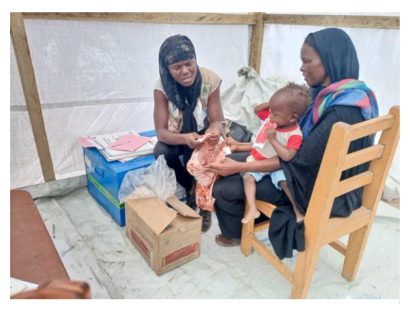
Treatment of severe acute malnutrition with plumpy nut on a child under 5 years old in Koufrounm 7 May 2023, @ Atchirund Mij