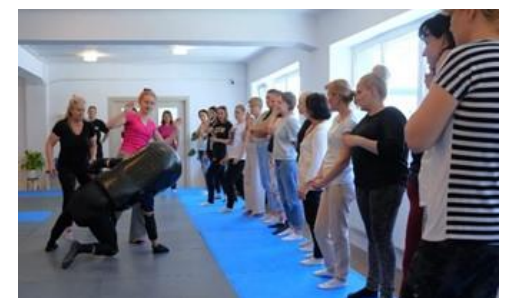
Self-defence workshop conducted by Sensiblu Foundation in Bucharest on 6 May.

UNHCR, through its partner Sensiblu Foundation, is supporting refugee women from Ukraine to enhance life-skills enabling them to protect themselves from risk of gender-based violence. On 6 May, Sensiblu Foundation, in cooperation with Impact Global, organized a half-day training session for a group of 35 refugees.