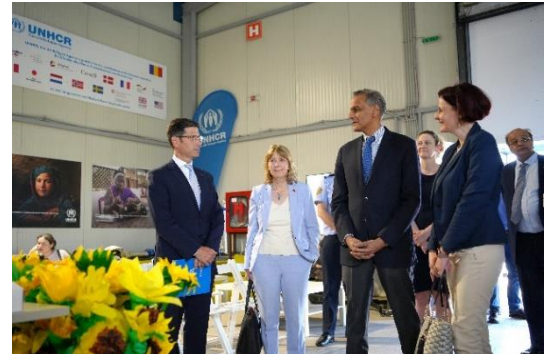
Visit of the US delegation at RomExpo on 19 May 2023.