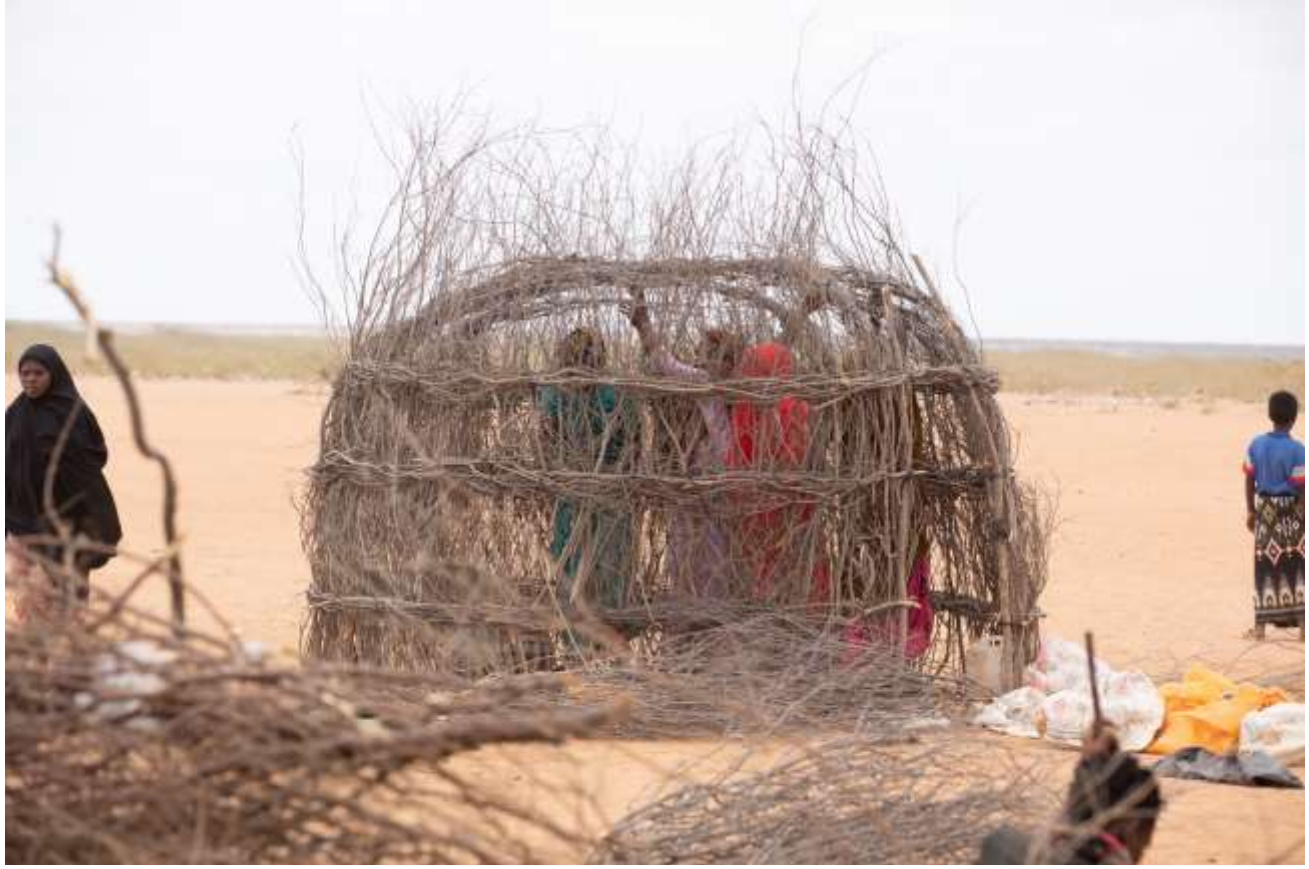
Khadija's friends help her make a makeshift kitchen for her family. Khadija arrived to Dadaab late last year fleeing the drought in Somalia.

The prolonged drought had pushed many pastoralist nomads into poverty, leading them to settle in nearby villages to find livelihood opportunities or alternatively receive relief food. UNHCR, under drought intervention and relocation of host community residing in the now re-gazetted Ifo2, has procured and distributed 302 shelter kits comprised of iron sheets, roofing nails, poles, and tarpaulins, to 302 households (1,800 individuals) to meet part of their shelter needs.