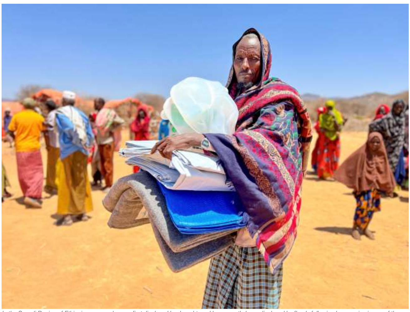
In the Somali Region of Ethiopia, a man, who was first displaced by drought, and has recently been displaced by floods following heavy rains is one of the people who received core relief items from UNHCR on 18 April 2023.