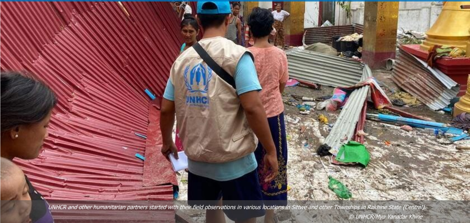
UNHCR and other humanitarian partners started with their field observations in various locations in Sittwe and other Townships in Rakhine State (Central).