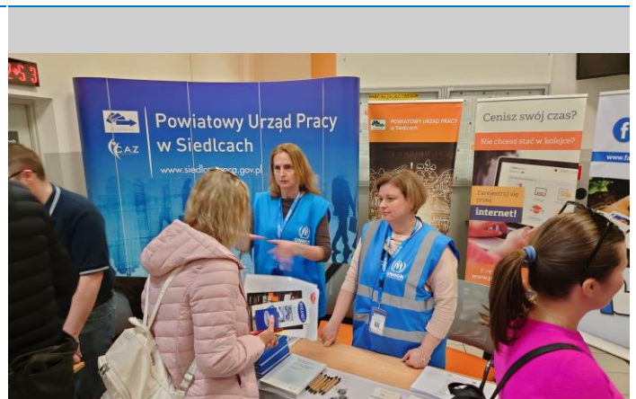
UNHCR at the Job Fair in Siedlce, Masovian Voivodeship. 21 April 2023.

Refugee arrivals reduced in 2023 but were expected to continue as the situation in Ukraine remains volatile, with widespread displacement and destruction. Some refugees have moved on in Europe and elsewhere, but large numbers of refugees from Ukraine remain in Poland. UNHCR has strategically positioned itself, boosting its presence and response to meet humanitarian needs on the ground, while also leading the coordination of national and international partners within the Regional Refugee Response Plan framework, in line with the Government-led efforts.