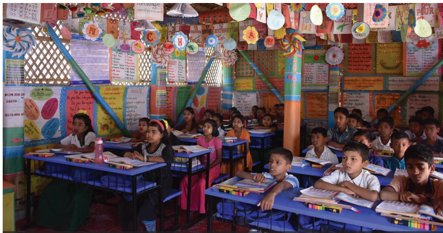
Rohingya Refugee children studying the Myanmar Curriculum Grade-1