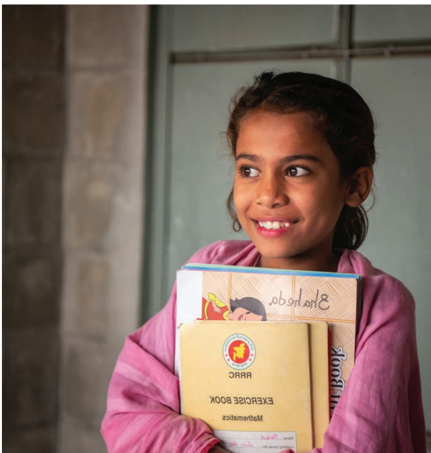
Student at the learning centre in Bhasan Char.

360 Adolescents and youth participated in basic numeracy, literacy and life skills courses