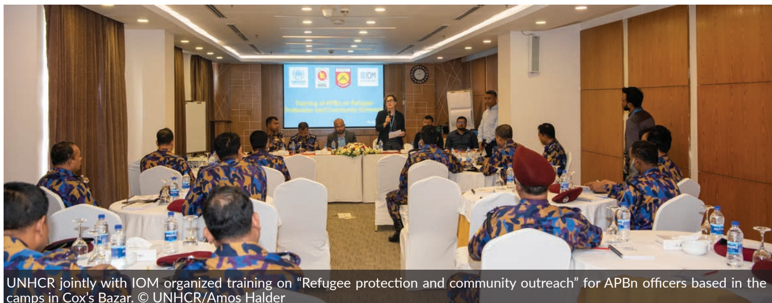
UNHCR jointly with IOM organized training on "Refugee protection and community outreach" for APBn officers based in the camps in Cox's Bazar.