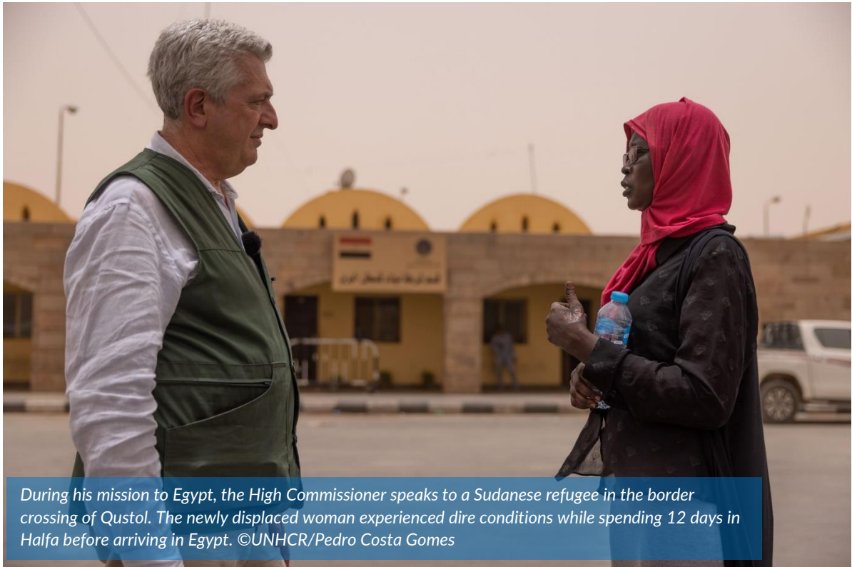
During his mission to Egypt, the High Commissioner speaks to a Sudanese refugee in the border crossing of Qustol. The newly displaced woman experienced dire conditions while spending 12 days in Halfa before arriving in Egypt.