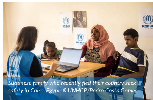
Sudanese family who recently fled their country seek safety in Cairo, Egypt.

Over 11,000 individuals who approached UNHCR so far have been given registration appointments. While the previous two weeks recorded a daily average of 500 individuals applying for asylum, during this reporting week an increase in this average is being observed, with more than 800 individuals approaching UNHCR for registration. In the next few weeks, the daily number of individuals seeking to apply for asylum is expected to steadily increase. UNHCR has scaled up registration capacity to respond to the demand.