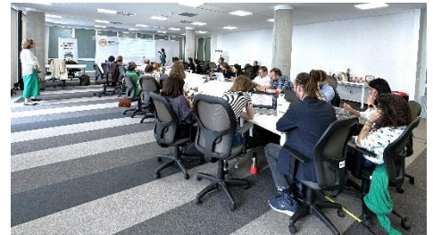
The validation workshop held in Brasov on 16 June 2023.

In order to increasingly serve refugees with specific needs, UNHCR is adopting a new vulnerability targeting methodology. On 16 June, the Municipality of Brasov and the Inter-Agency coordination platform, led by UNHCR, organized a workshop to validate the vulnerability assessment scorecard that has been developed in consultation with actors providing cash and other critical humanitarian assistance. Around 28 participants from 16 partners, including Municipalities, UN Agencies and NGOs participated validated the vulnerability criteria for assistance, including cash. UNHCR will soon pilot this new methodology with a small case of 400 vulnerable refugees for the Cash for Protection programme. This scorecard will be a source available to humanitarian partners to achieve a coherent response in critical areas of support.