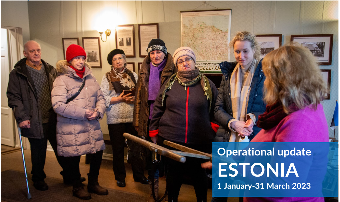
A group of refugees from Ukraine attend an event at the Oandu nature centre, organized by the Estonian Human Rights Centre and the Social Centre of Tallinn City Centre