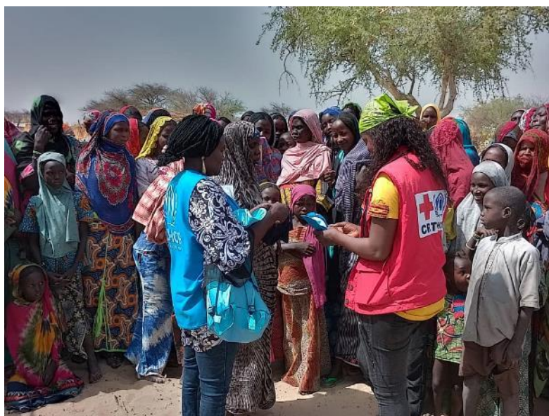
Distribution of dignity kits to women/girls of childbearing age at the Baboul site (Lac Province), 7/4/2023