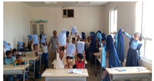
Distribution of school uniforms at Markazi school