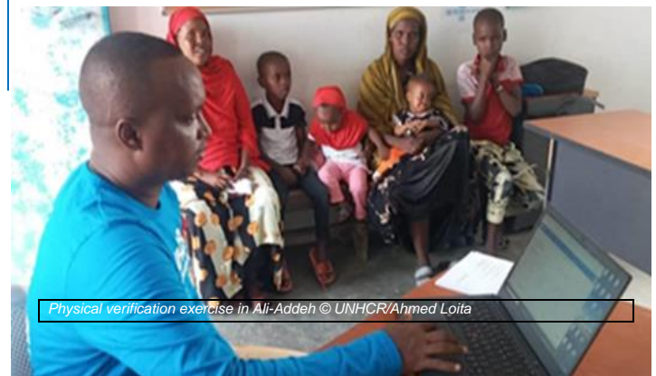
Physical verification exercise in Ali-Addeh