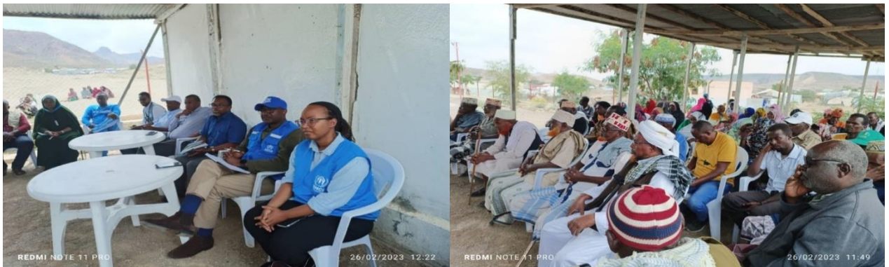
The Principal Operations Coordinator for the East Africa, Great Lakes and Horn of Africa region during his mission to Djibouti in February 2023