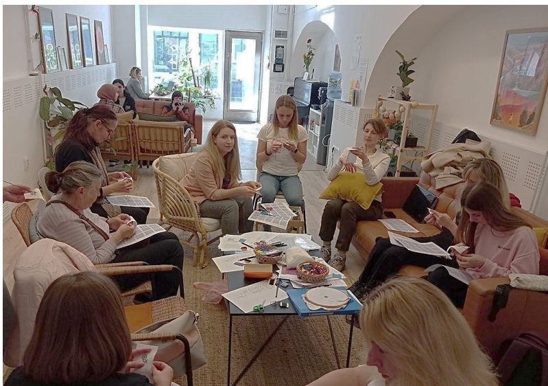
Refugees from Ukraine attending the embroidery class at the Budapest Helps! Community Center, jointly run by Budapest Municipality, IOM and UNHCR.

1 Multi-country office in Budapest, also supporting national offices in the Czech Republic, Slovakia and Slovenia.