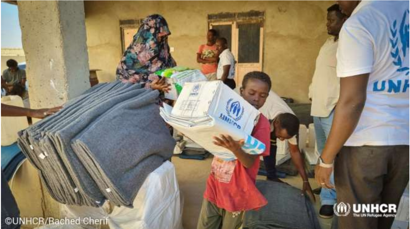
Together with community volunteers and partners, UNHCR is distributing core relief items in Wadi Halfa, Northern Sudan, to Sudanese families displaced by the ongoing conflict. These kits include much-needed shelter materials, kitchen sets, solar lamps, and blankets.