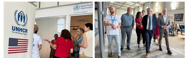
On 26 July, a delegation from the US Bureau of Population, Refugees, and Migration (PRM) visited UNHCR's integrated service hub for refugee from Ukraine in Bucharest.