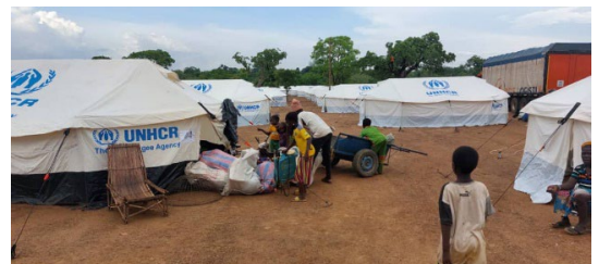
Arrival of asylum seekers at the new Tarikom Refugee Reception Centre in the Upper East region