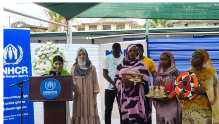
Some Sudanese and Afghan refugees displaying their culture during WRD