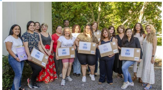
Refugee woman who learned programming thanks to the UNHCR project