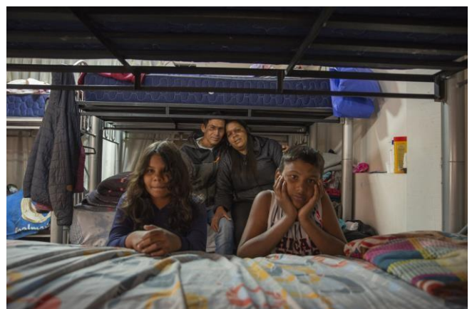
Refugee family in transit in Bolivia hosted in a temporary shelter in La Paz