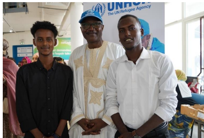
World Refugee Day, 20 June 2023 at Djibouti-city