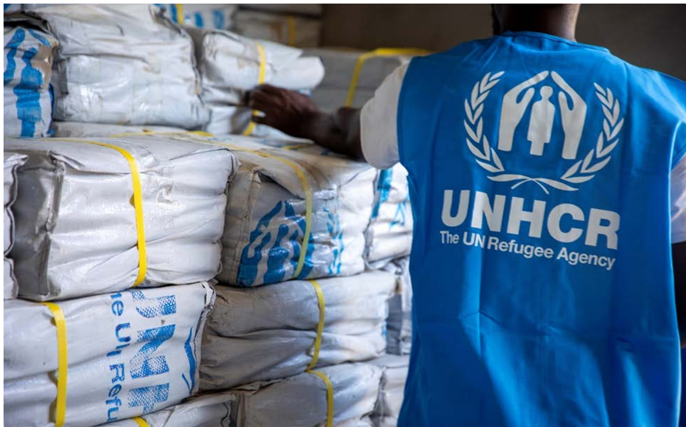
Trucks carrying UNHCR aid to thousands displaced by floods, Libya.