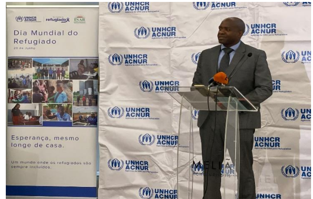
UNHCR Representative and INAR Director both speaking at Press Conference on WRD in Maputo.