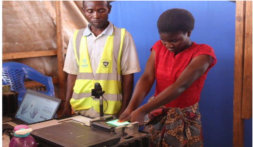
Biometric scanning for Civil Documentation