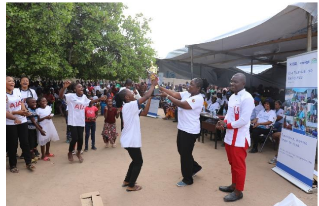
Burundi Ngoma performing and the Head of the UNHCR Nampula Field Office handing a trophy to the winning team of the WRD championship at Maratane refugee settlement, Nampula.