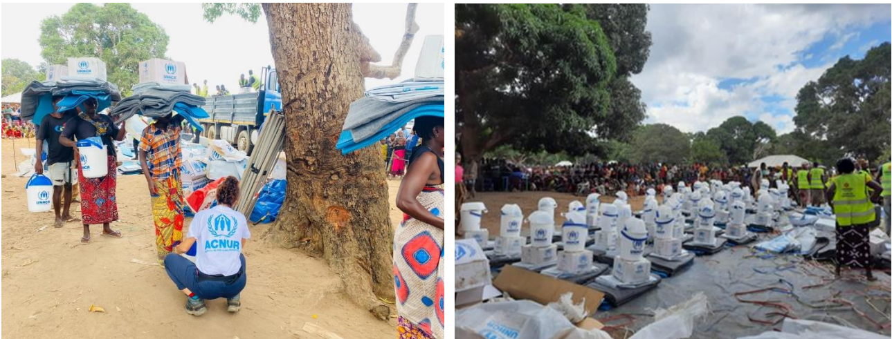
CRI Distribution in Mueda, Cabo Delgado Province