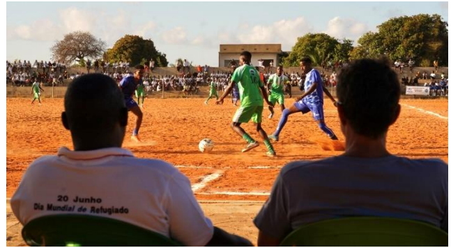
Women's and Men's football championship and solidarity race on World Refugee Day in Cabo Delgado.