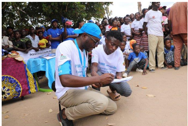
Protection Monitoring Activities