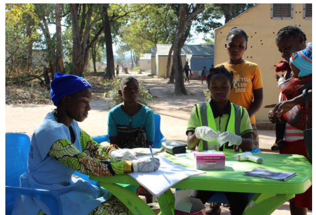
Health staff at Mantapala settlement attending to a refugee mother during an ante-natal session.