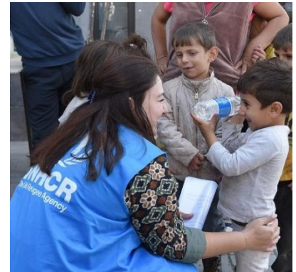
Recently arrived refugee children wait at the registration centre in Goris, Syunik province on 29 September.

In just a week, over 100,000 refugees have fled to Armenia, entering through the Syunik region in the south of the country. As of 30 September 2023, Armenia reported 100,480 refugees had arrived in the country since 23 September 2023. So far, government authorities registered 83,467 refugees at two registration centres established in the border provinces. Most refugees arrived with few belongings and require urgent assistance , including blankets, bedding materials, medical and psychosocial support, as well as shelter in the immediate term. Armenian authorities are providing temporary accommodation to 34,607 new arrivals without relatives in Armenia, including in hotels, social centres and schools. However, given the high number of arrivals in the short period, additional emergency centres are urgently needed. The Government together with the international and national community are working to address urgent needs of those arriving.