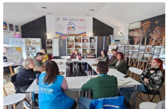
Focus group discussion conducted in Suceava on 5 October 2023.

UNHCR is conducting focus group discussions (FGDs) with the refugees from Ukraine and refugees of other nationalities living across Romania. This exercise will help UNHCR plan protection programmes and interventions for 2024. Dedicated consultations with refugee women, men, boys, and girls from different social groups are now ongoing throughout the country to identify their specific protection risks. So far, 108 Ukrainian refugees including 53 women, 35 men and 20 youth participated in 12 consultations in Bucharest, Suceava, Iasi, Galati, Constanta and Brasov. In parallel, UNHCR is also developing its detail planning for next year in consultation with partners involved in the refugee response.