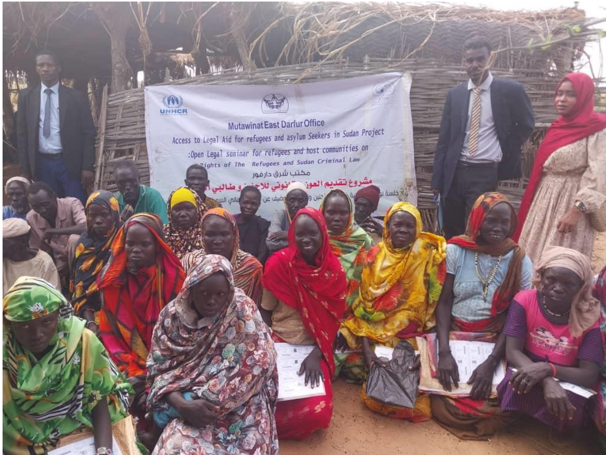
In East Darfur, UNHCR's partner, Mutawinat, conducted a legal seminar for South Sudanese refugees, raising awareness on their rights and responsibilities.