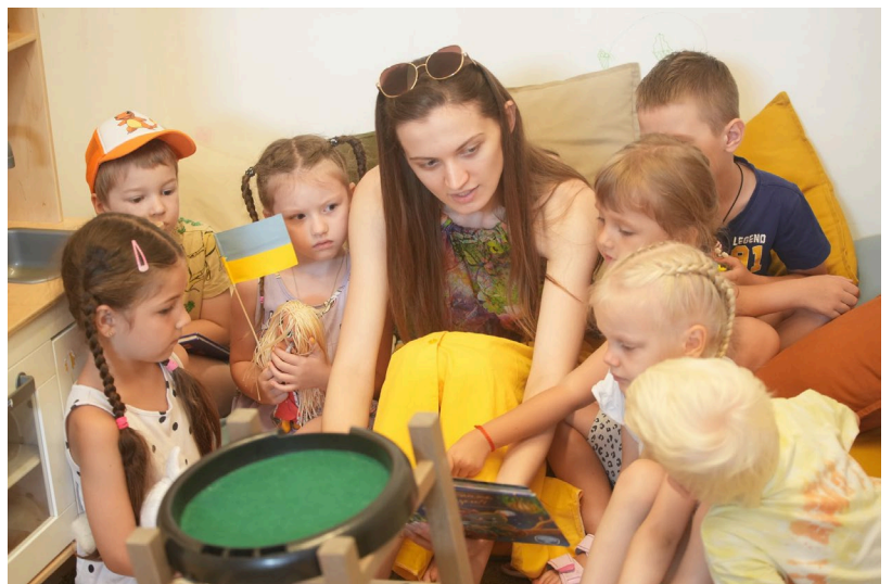
Refugee children from Ukraine in the summer camp organized by UNHCR at the Budapest Helps! Community Center, which is jointly run with the Budapest Municipality and IOM.

1 Multi-country office in Budapest, also supporting national offices in the Czech Republic, Slovakia and Slovenia.