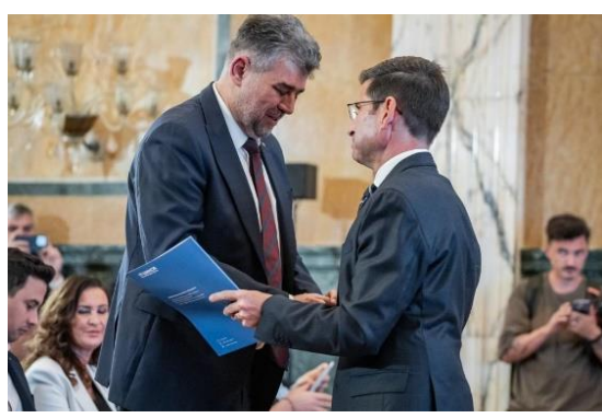
On 1 November, Prime Minister Marcel Ciolacu hosted UN Agencies and guests for the marking of UN Day at Victoria Palace.

On 1 November, the United Nations (UN) agencies in Romania marked UN Day with an event hosted by the Government of Romania at Victoria Palace in Bucharest. The Prime Minister, Mr. Marcel Ciolacu, and some 250 representatives of national and local authorities, the diplomatic community, NGOs, and partners were present. In his opening address, Prime Minister Ciolacu said "The UN Refugee Agency has played a vital role in supporting refugees and asylum seekers in Romania. Their tireless commitment to protect, assist those forced to leave their homes is a