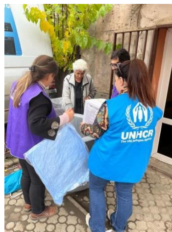
UNHCR and Mission Armenia, distributed household items to refugees in Kapan communities of Syunik province. October 2023